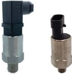
Sensing Element: Ceramic